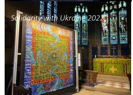
Solidarity with Ukraine 2022