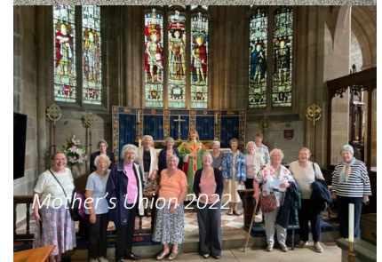
Mother's Union 2022