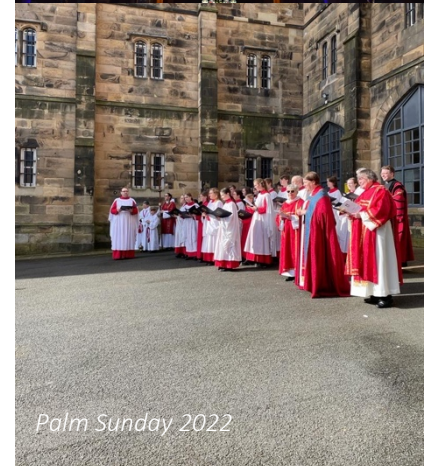
Palm Sunday 2022