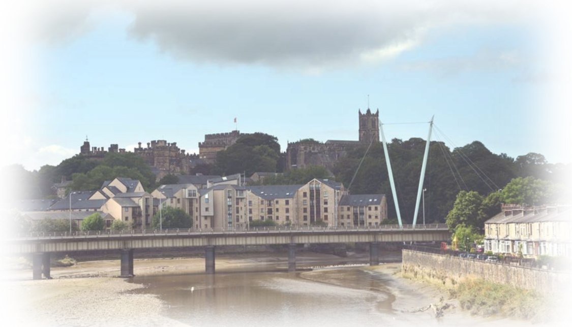
Lancaster

There are 2 primary schools within the parish, Dallas Road CP and Willow Lane CP, and a Steiner School. The church enjoys good links with both primary schools – children from them have taken part in ‘sing-a-long’ events in church in previous years. Lancaster has a high achieving and successful church secondary school – Ripley St Thomas Church of England Academy. Many Ripley children attend the Priory and end of term services and Awards Evening are also held in the church. Ripley School has a chapel which has a Chapel choir that sings Evensong fortnightly during Term time. Whilst we do not provide musical support for this, the vicar is a regular officiant. Many children in the Priory choir are Ripley students. Places at Ripley are in great demand and many families attend the Priory in the hope of securing admission. Lancaster Girls’ Grammar School is also within the parish.