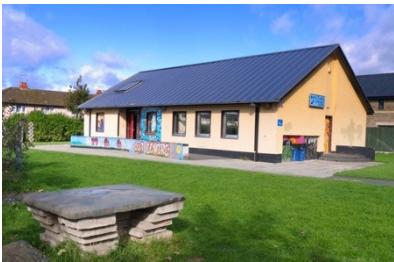
The Marsh Community Centre

Although Lancaster Priory has an able and committed core of lay people, these are largely drawn from amongst the retired. Those of a working age are often more peripheral to the life of the church. University students can struggle to make links with the rest of the congregation. As the Priory emerges from the pandemic, it is clear that the work of evangelism and mission with children, young people and their families has suffered. There is a strong cohort of choir families who are committed to the Priory but not necessarily well integrated into its life and ministry. We long for the Priory congregation to become broader and more diverse, better representative of our parish and city.