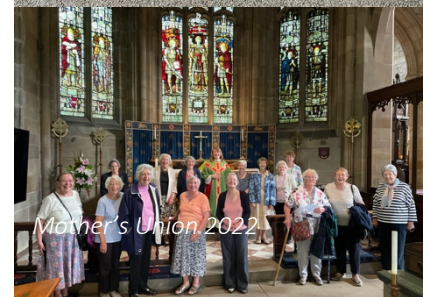
Mother's Union 2022