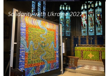
Solidarity with Ukraine 2022