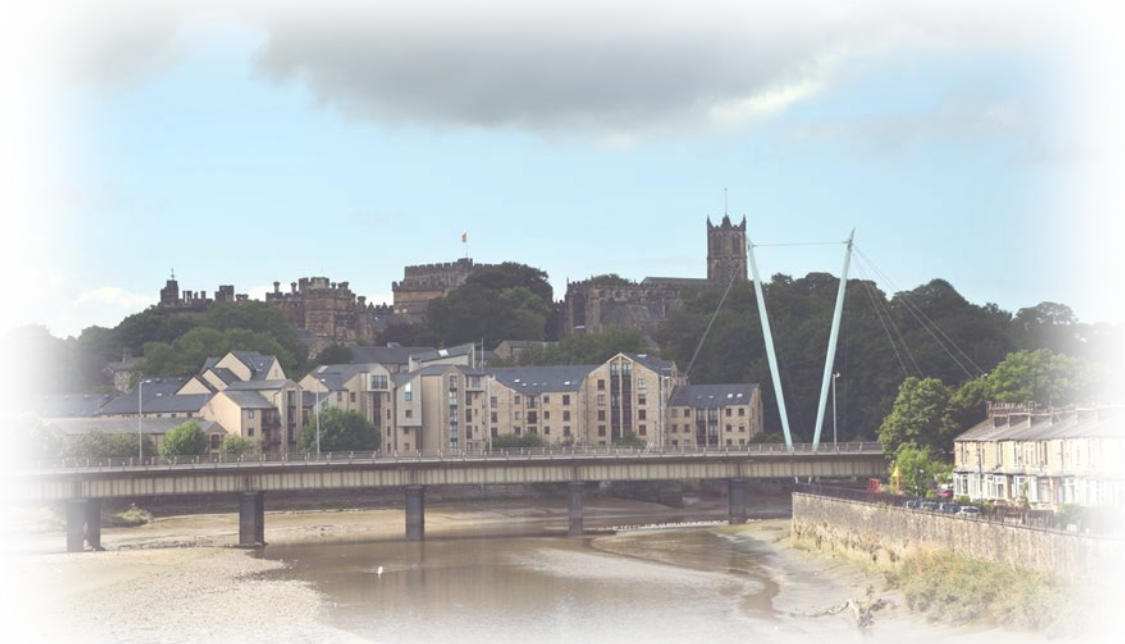
Lancaster

There are 2 primary schools within the parish, Dallas Road CP and Willow Lane CP, and a Steiner School. The church enjoys good links with both primary schools – children from them have taken part in 'sing-a-long' events in church in previous years. Lancaster has a high achieving and successful church secondary school – Ripley St Thomas Church of England Academy. Many Ripley children attend the Priory and end of term services and Awards Evening are also held in the church. Ripley School has a chapel which has a Chapel choir that sings Evensong fortnightly during Term time. Whilst we do not provide musical support for this, the vicar is a regular officiant. Many children in the Priory choir are Ripley students. Places at Ripley are in great demand and many families attend the Priory in the hope of securing admission. Lancaster Girls' Grammar School is also within the parish.