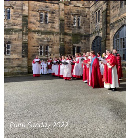
Palm Sunday 2022