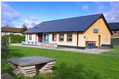
The Marsh Community Centre

Although Lancaster Priory has an able and committed core of lay people, these are largely drawn from amongst the retired. Those of a working age are often more peripheral to the life of the church. University students can struggle to make links with the rest of the congregation. As the Priory emerges from the pandemic, it is clear that the work of evangelism and mission with children, young people and their families has suffered. There is a strong cohort of choir families who are committed to the Priory but not necessarily well integrated into its life and ministry. We long for the Priory congregation to become broader and more diverse, better representative of our parish and city.