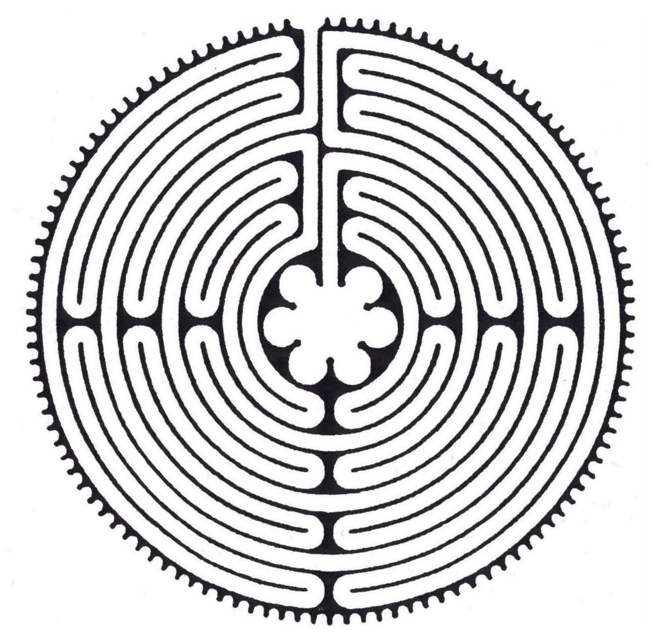
Welcome and Introduction Opening Silence