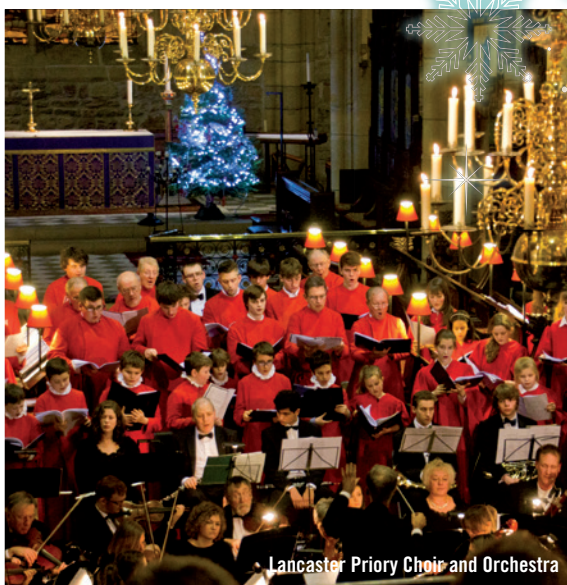
Lancaster Priory Choir and Orchestra